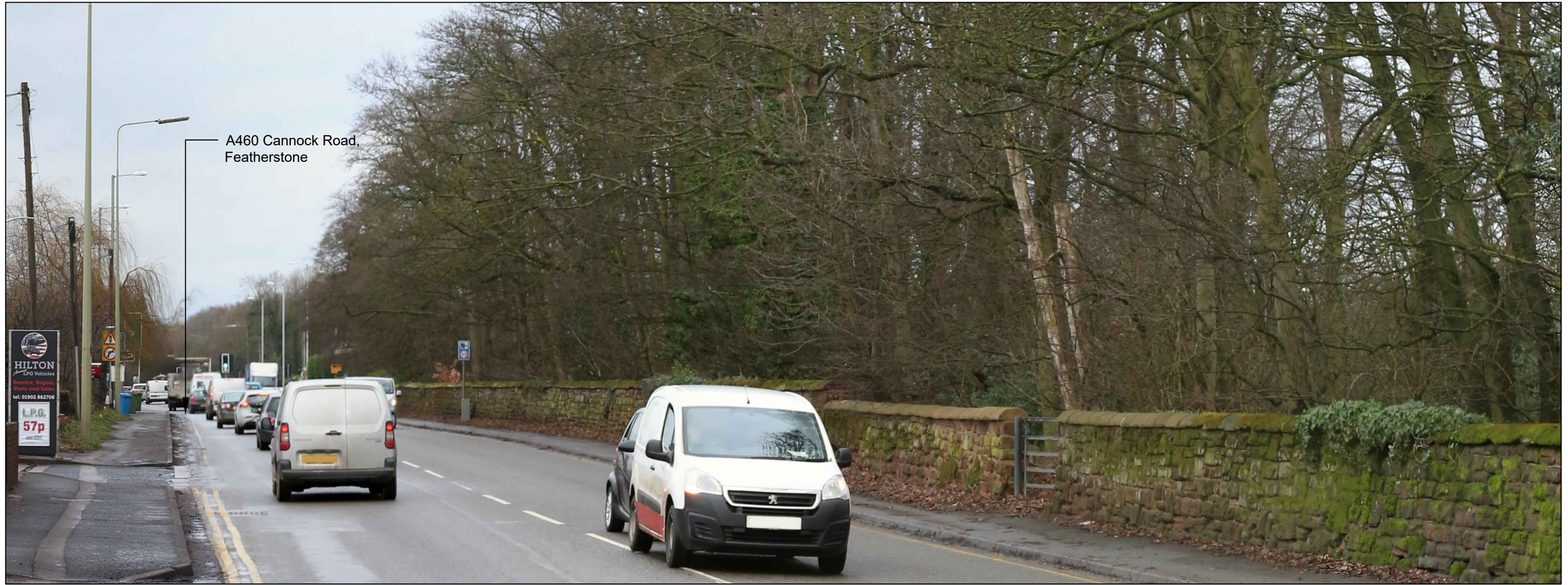
A460 Cannock Road, Featherstone