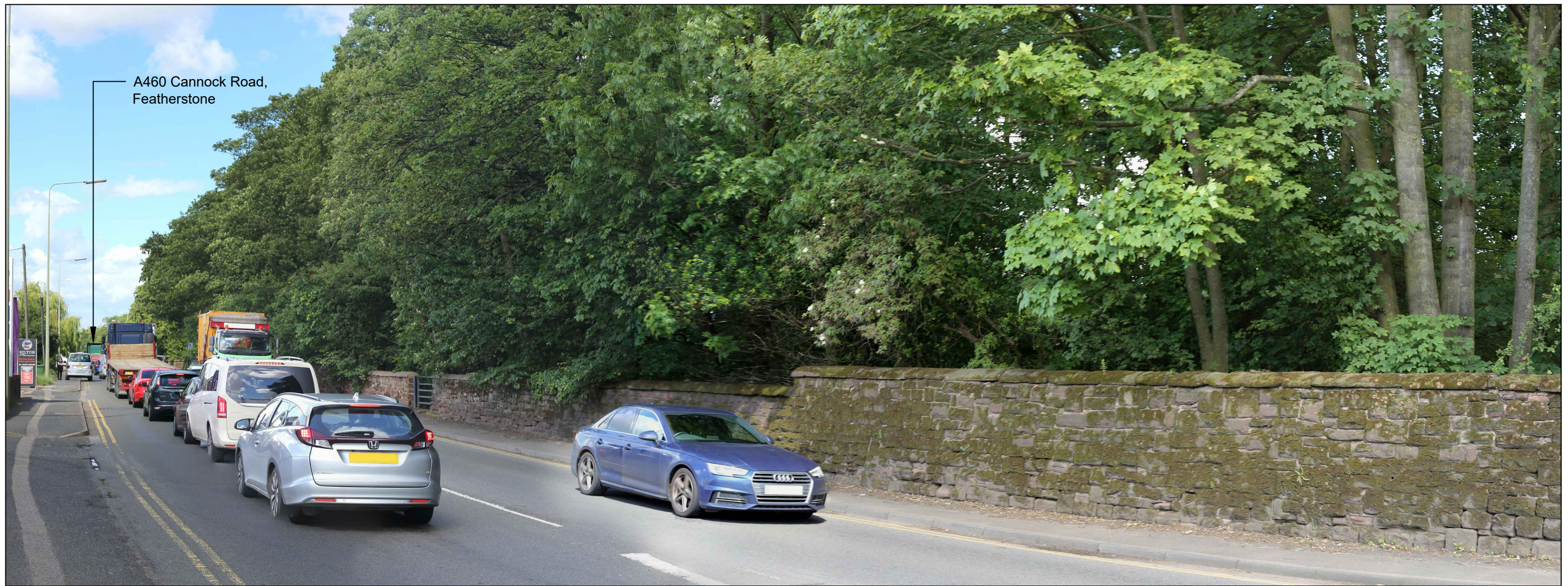
Extent of 50mm single frame image

Viewpoint number: 2 Location title: View from A460 Cannock Road, Featherstone Camera model: Canon EOS 6D Focal length: 50mm Field of View: 65° (Horizontal) Camera height: 1.6m Photo taken: 20/06/2019 Coordinates: 394247, 305182 Elevation: 138m AOD